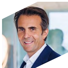
Chairman and CEO, Havas